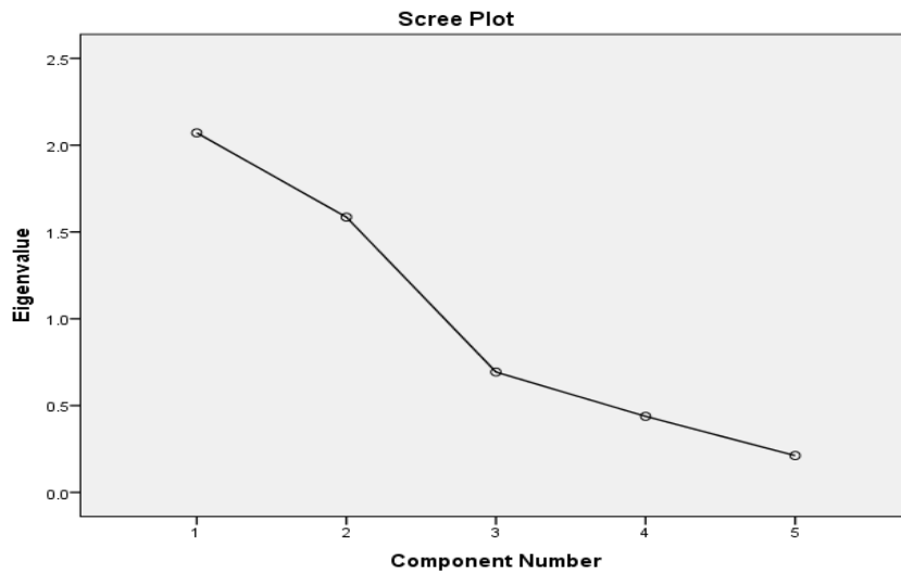
Graph 1. Scree Plot

From the above graph of Scree plot 1, it can be concluded that the factors having the Eigen values more than 1 have to be considered. This study determines 3 factors.